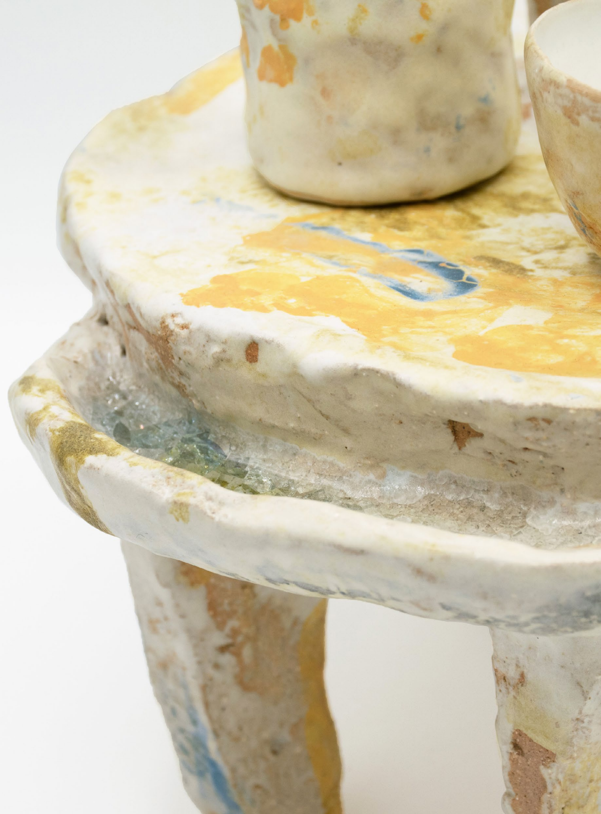
Recycling mix stoneware, enamel, slip, bottle glass fragments firing in an electric oven at 1280°C 26x22x23,5cm 2022