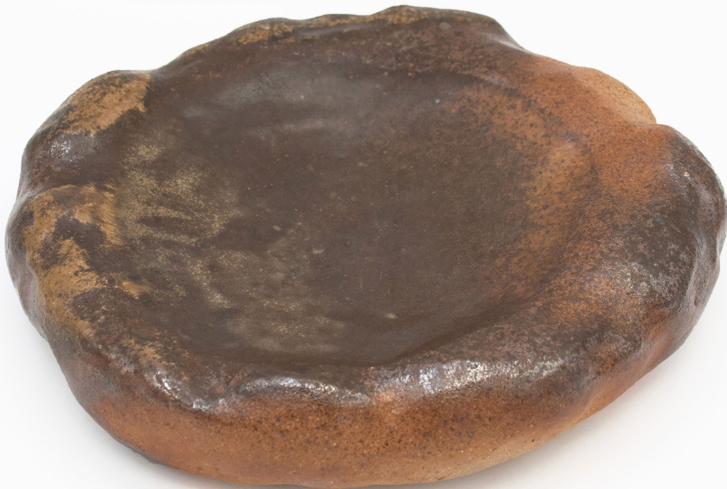
Chamotte white stoneware, enamel with beech ash from the «Le Remini» pizzeria, wood oven firing 1320°C 19,5x19x5cm 2021