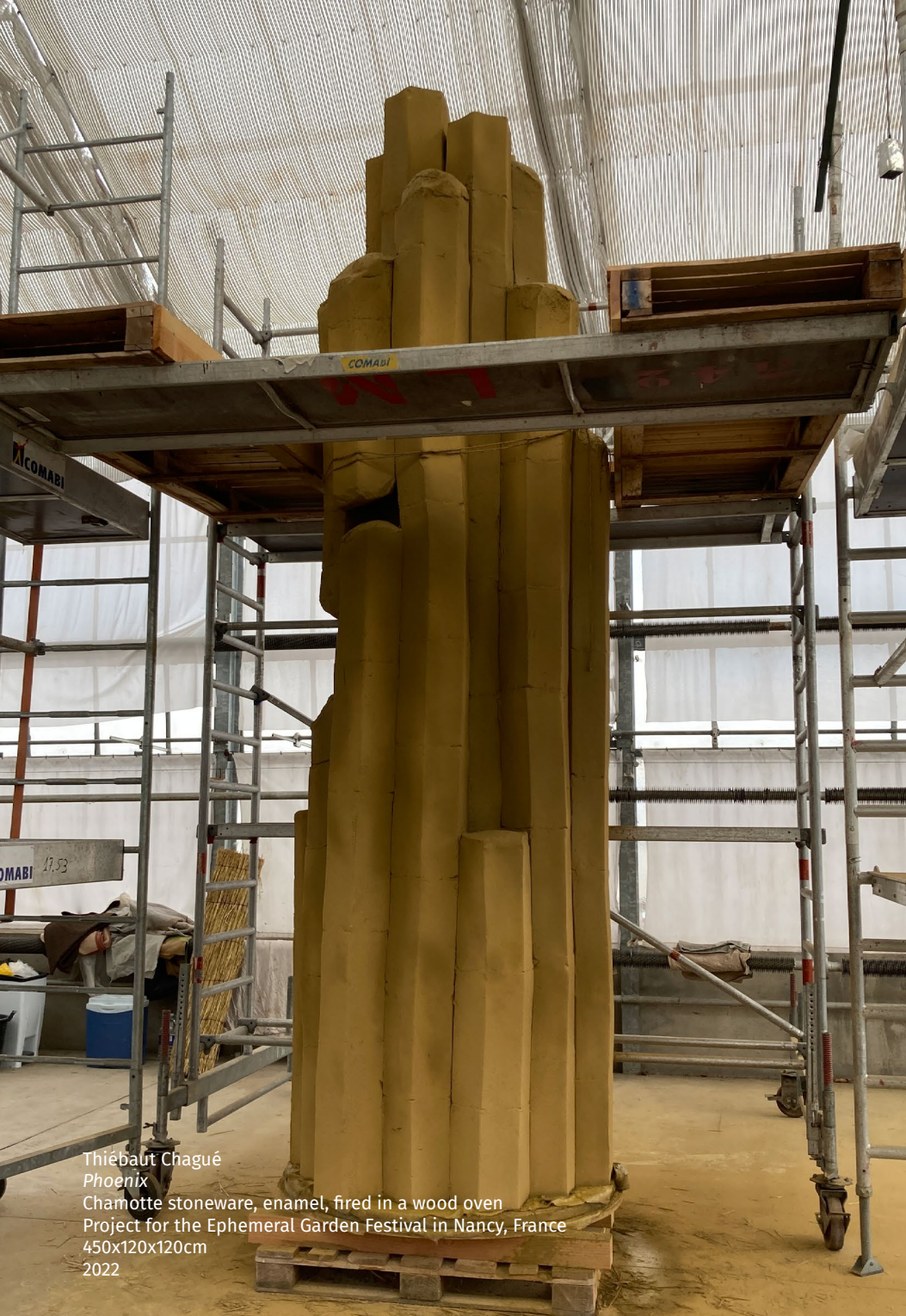
Thiébaud Chagué Phoenix Chamotte stoneware, enamel, fired in a wood oven Project for the Ephemeral Garden Festival in Nancy, France 450x120x120cm 2022