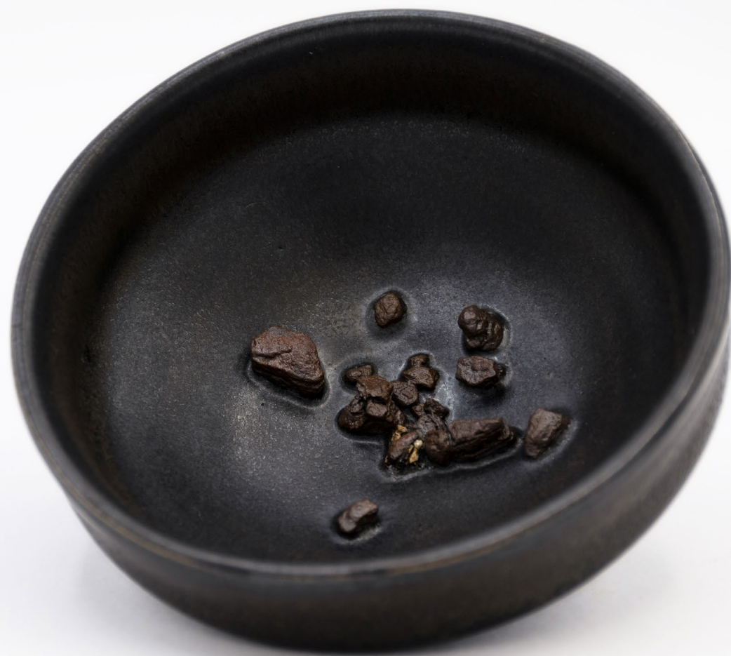
Enamelled white stoneware, pieces of slate from Guebwiller flower boxes, firing in an electric oven at 1260°C 9,5x9,3x4,4cm 2022