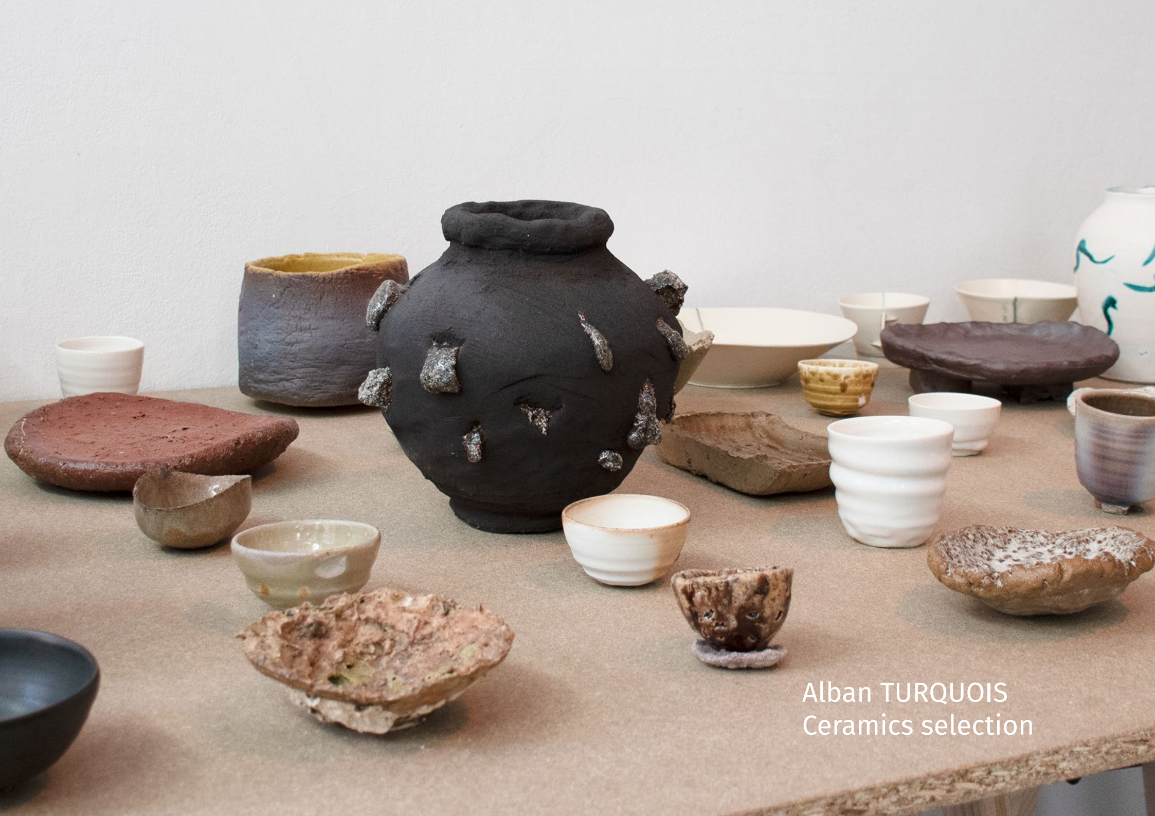
Alban TURQUOIS Ceramics selection