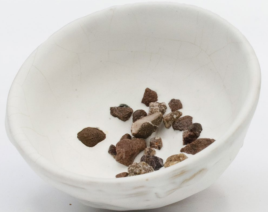
Enamelled white stoneware, rocks from the Esterel massif, oven firing electric 1280°C 9,8x9,6x4,3cm 2022