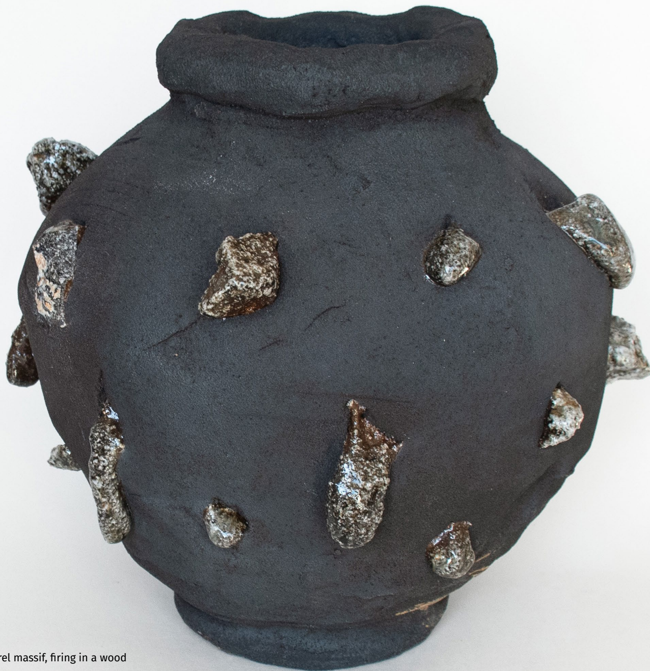
Black stoneware, clay rocks from the Esterel massif, firing in a wood oven at 1320°C 20x20x21,5cm 2022