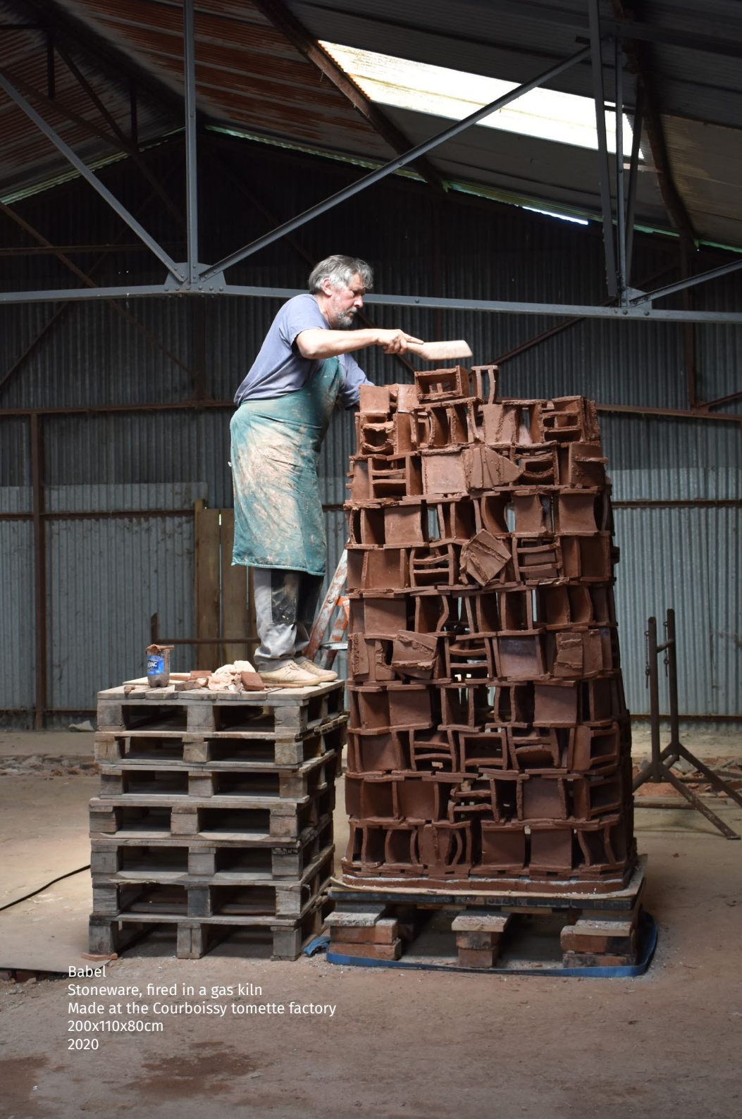
Babel Stoneware, fired in a gas kiln Made at the Courboissy tomette factory 200x110x80cm 2020