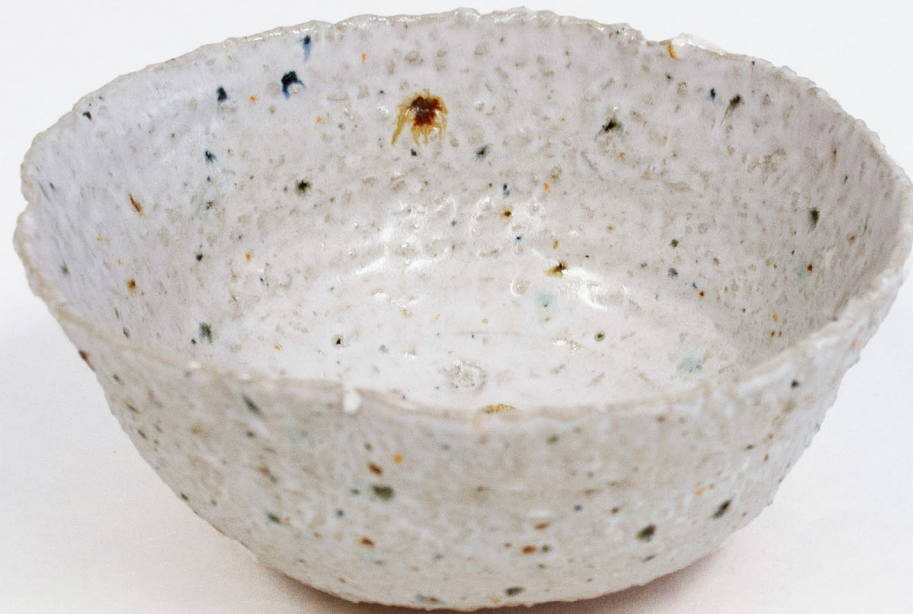
Enamelled red stoneware, chamotte of enameled trial shards, firing in electric oven at 1280°C 13,5x12,7x6,5cm 2022