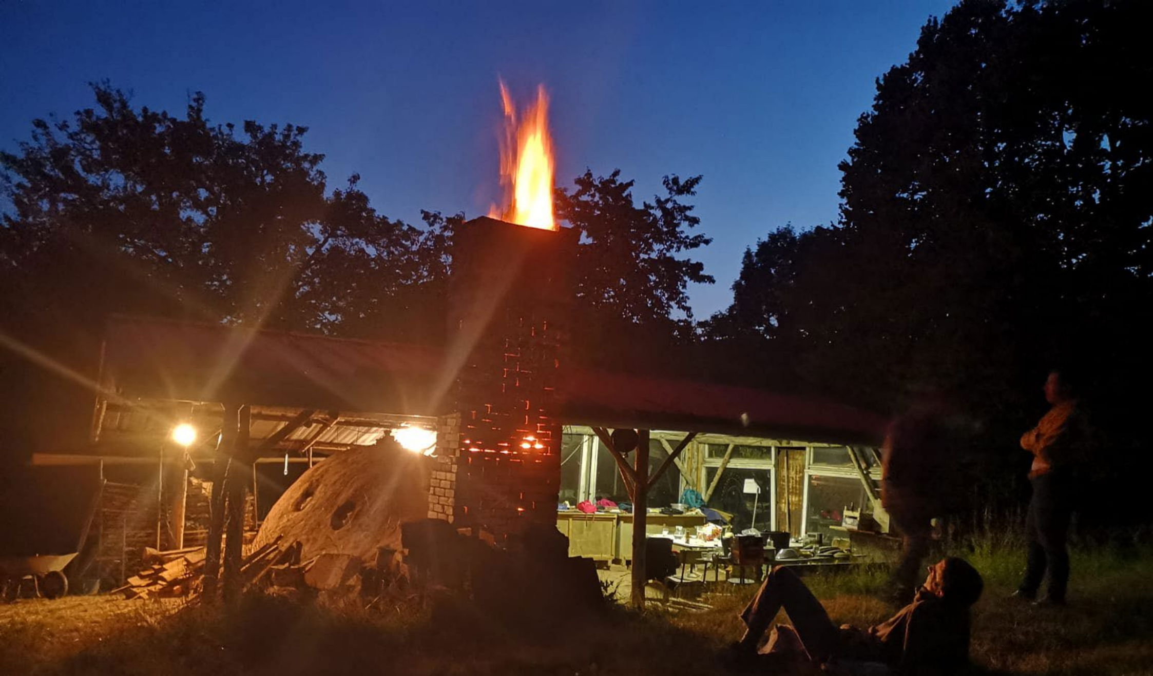
Projects as an artist's assistant