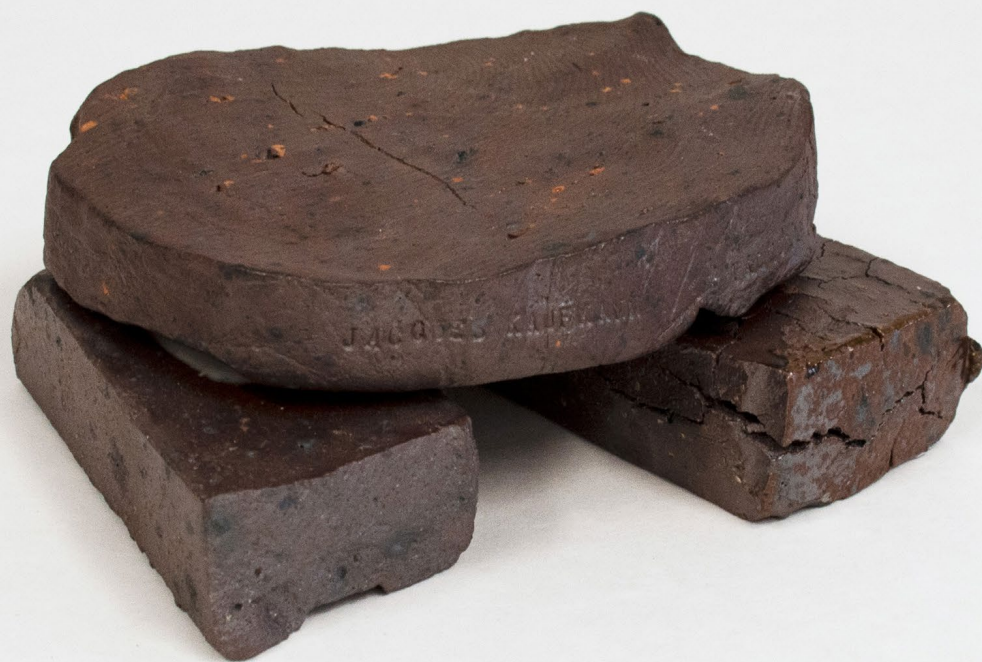
Courboissy red stoneware, bricks of Courboissy factory, enamel, gas oven firing 1280°C 14x15x5cm 2022