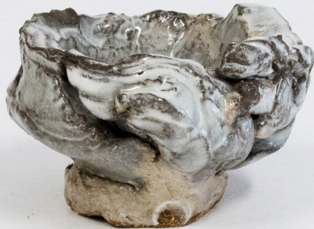
Recycling mix stoneware, white enamel firing in an electric oven at 1280°C 10x8,8x6,5cm 2022