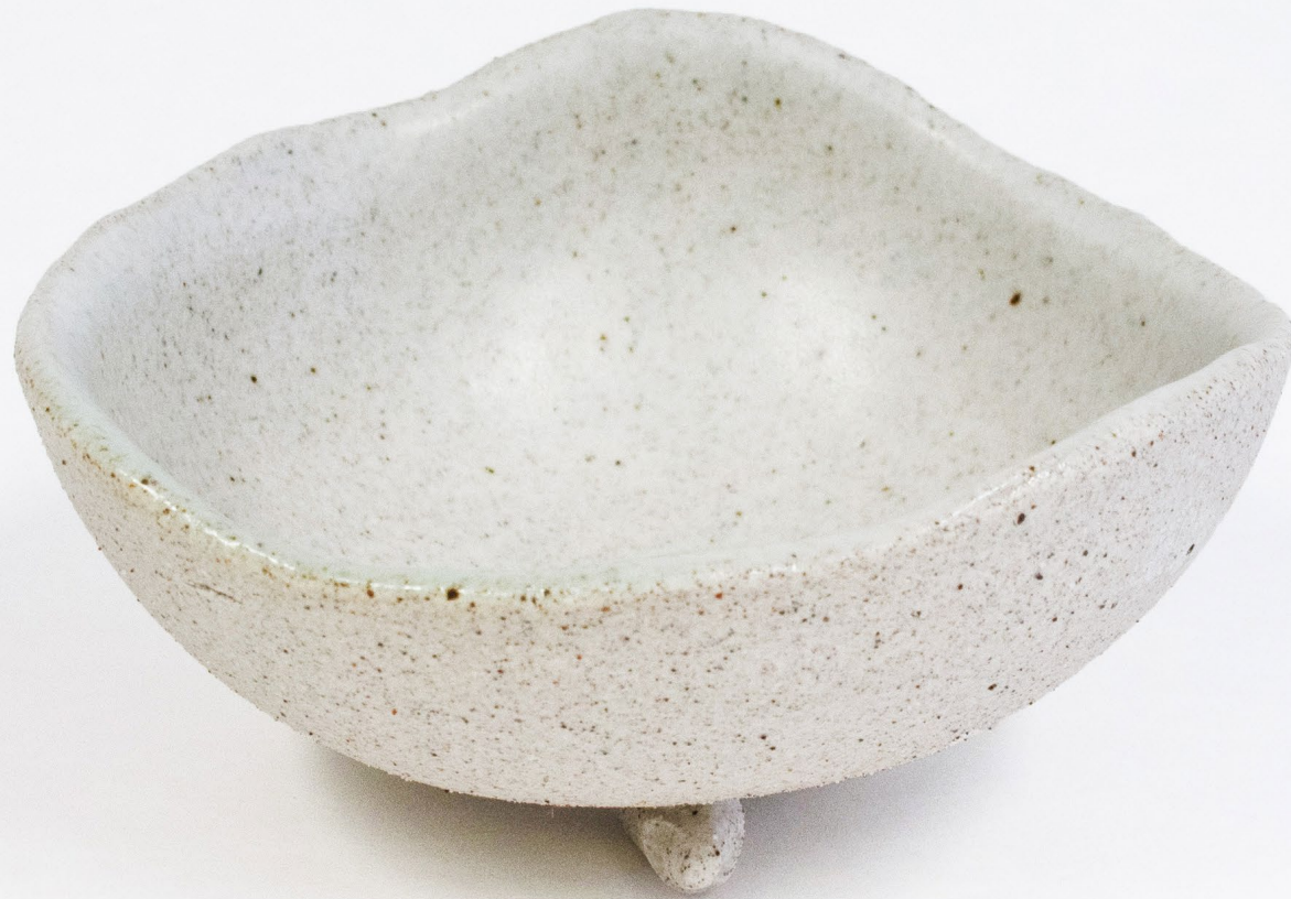
Porcelain, sand from the vines of Guebwiller, enamel, firing in an electric oven at 1280°C 18,5x17,5x9,5cm 2022