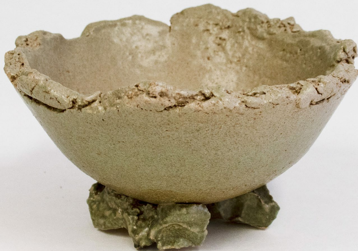
White stoneware, beech ash from the «Isola Bella» pizzeria, chamotte from red stoneware, enamelled, oven firing electric 1280°C 15,5x15,5x8,5cm 2022